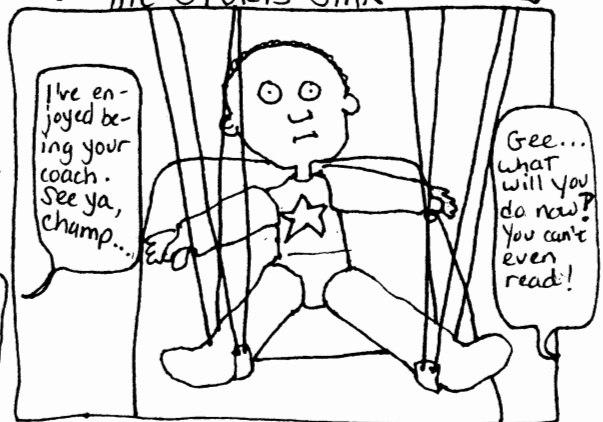
THE SPORTS STAR