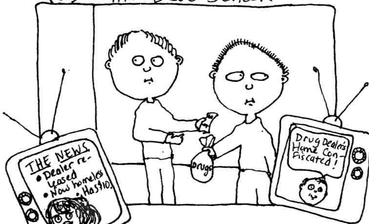
THE DRUG DEALER