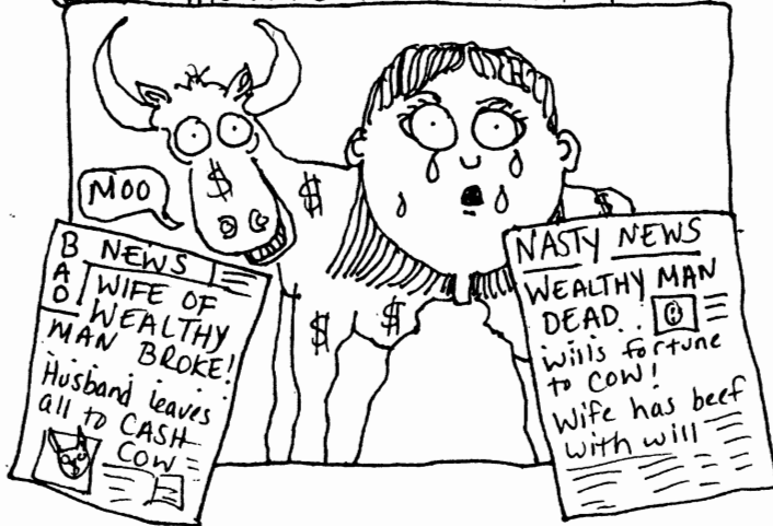
THE WIFE OF A WEALTHY MAN